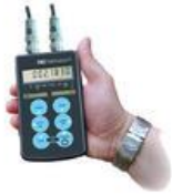
PSD232 Portable digital load cell indicator with RS232 TEDS enabled